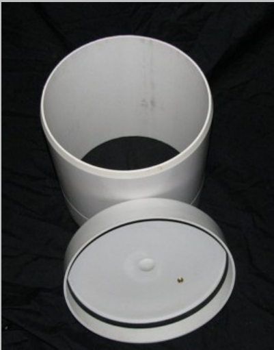
PUSH ON LID 250mm diameter