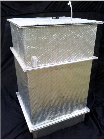
CHAMBER + EXTENSION + BASE 500x500mm. 250mm high chamber with fan, vent and sampling port. 500mm high extension. Stainless steel base.