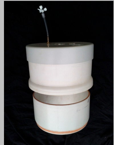
PVC BASE RING + CHAMBER 250mm diameter Ring stands 30mm above soil