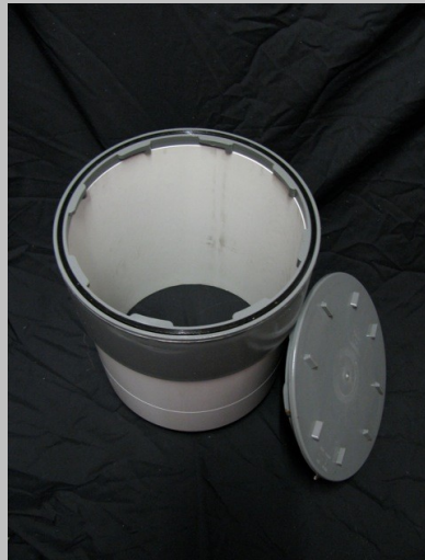
1/4 TURN LID 250mm diameter